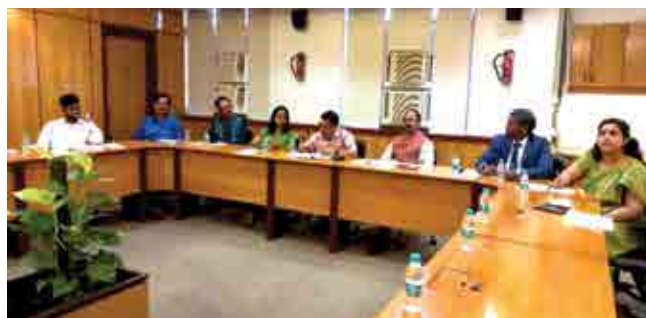
Participants of NAAS BSS held on 1st September, 2023

On the other hand, extensive grazing practices and natural pastoral production system used in India mainly uses rain water/green water resulting in smaller water footprint while local production and consumption habits are leading to lower food miles. Nevertheless, mapping of energy and water usage in the animal-sourced food sector has not been attempted. With this background, the National Academy of Agricultural Sciences, New Delhi organized a brainstorming session (BSS) on “Greening of Livestock and Poultry Sector: Policy