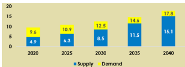
Supply and Demand Gap Estimations (figures in lakhs)

In a forecasts study, a robust Compound Annual Growth Rate (CAGR) of 3.1%, has been projected showing an escalation in demand from 9.6 lakhs to 17.8 lakhs between 2020 and 2040 (see BOX). Disciplines like agriculture engineering, agri-business management, and food technology are poised to exhibit higher growth rates, underlining the increased demand for specialised